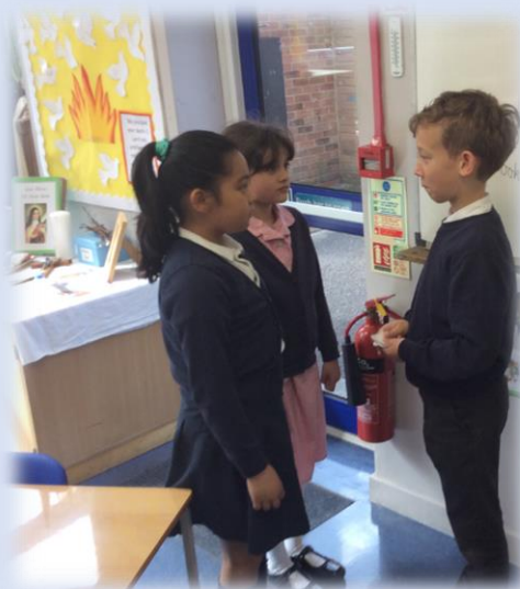
Road to Emmaus role-play