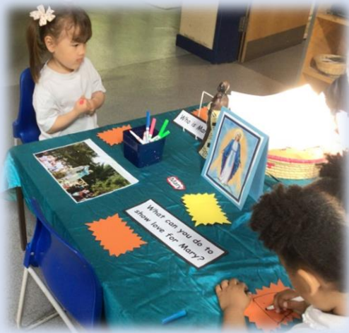
Nursery responding to questions about Mary through drawing.