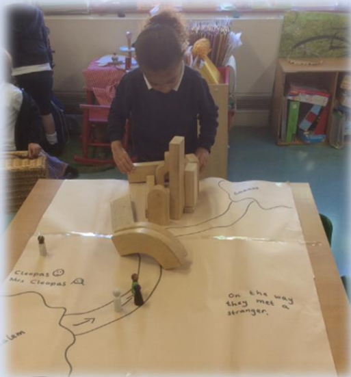
Reception role-playing the Road to Emmaus