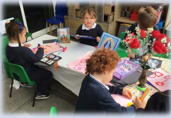
Nursery creating Marian art outdoors.

This half term, the theme was "New Life". The children heard that Jesus was raised to new life at Easter and learned how Jesus went back to his Father in Heaven and promised his friends that one day they would also be able to go to the Father. Key stories that they listened to and learned were Pentecost and Jesus Ascension into heaven. The children particularly enjoyed acting out the Road to Emmaus.