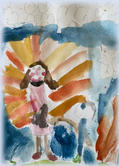
Year 1 Art on Doubting Thomas