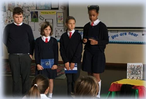
Year 6 Black History Month Assembly