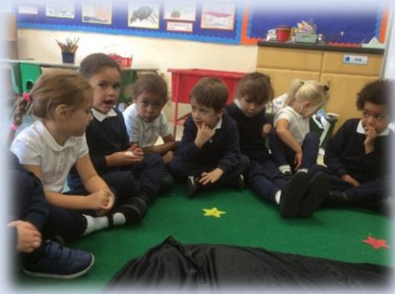
"Let there be Light!" Reception reading the story of Creation Genesis 1

could look after each other. Our Early Years and Key Stage 1 classes love doing Godly play to learn about the creation stories.