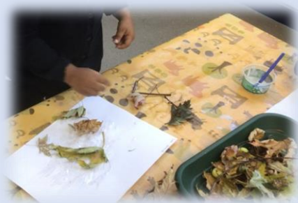
Nursery admiring God's creation