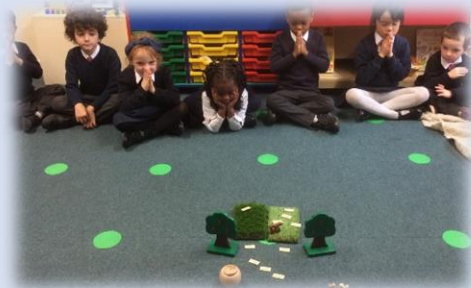
Adam and Eve Godly Play