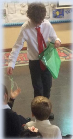
RE Ambassadors giving KS1 their Rosary beads

A very valuable learning experience and a good start to the children's journey as pupil chaplains.