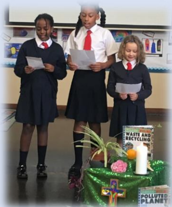
The children singing their own songs about creation in KS2 Assembly