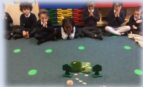
Adam and Eve Godly Play