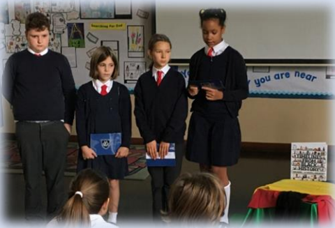
Year 6 Black History Month Assembly