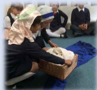
Role Playing Moses and The Exodus