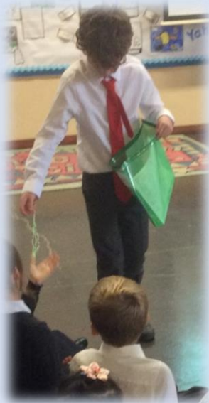
RE Ambassadors giving KS1 their Rosary beads

A very valuable learning experience and a good start to the children's journey as pupil chaplains.