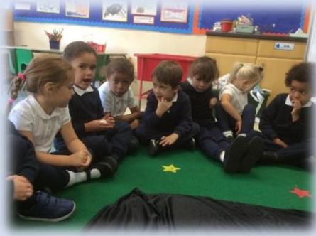
"Let there be Light!" Reception reading the story of Creation Genesis 1

could look after each other. Our Early Years and Key Stage 1 classes love doing Godly play to learn about the creation stories.