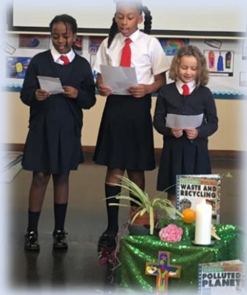
The children singing their own songs about creation in KS2 Assembly