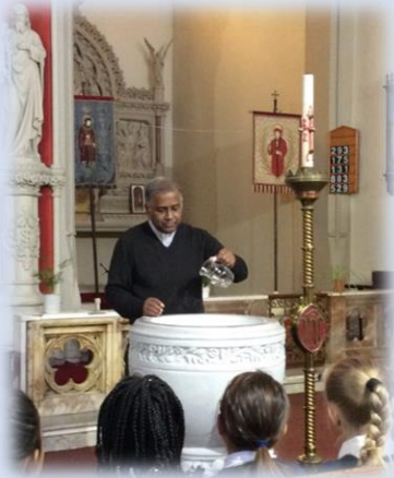
Fr Alex explaining the signs and symbols of the Sacrament of Baptism