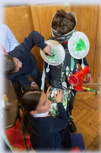
Creating a superhero to help stop pollution.