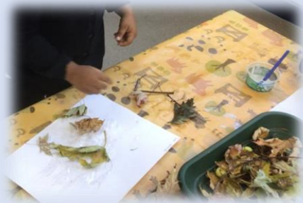
Nursery admiring God's creation