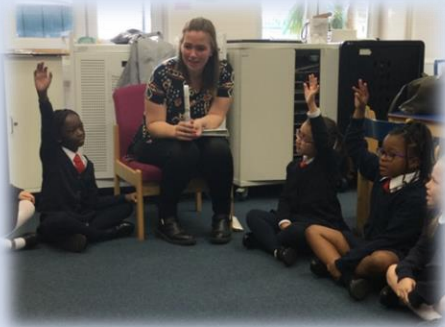
Parent describing what happens at the Baptism